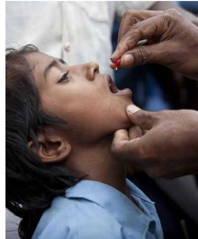
Vitamin A capsules distribution

In two special Paediatric Camps 1,293 children were examined.