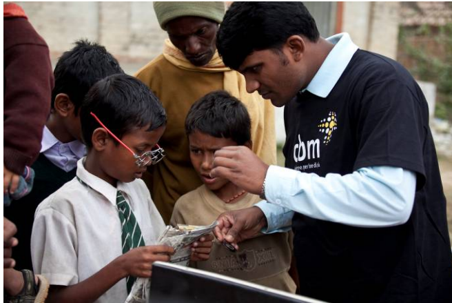
1,880 children were screened in 11 schools